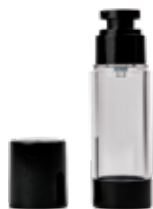
Black 50ml Airless Pump Label Size: 78mm(H) x 105mm(L)

A luxurious moisturiser with rich ingredients such as Vitamins A,C and E, Jojoba, Rosehip and Evening primrose oils, shea butter and marine collagens for hydration. Suitable for normal – dry/ageing skin types.