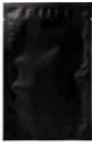
Black Sheet Mask Sachet Label Size: 50mm(H) x 100mm(L) 2, Labels - Front & Back

5 – 50 units = $5.45 each 50 – 99 units = 15% discount 100 – 499 units = 20% discount 500 units+ = 35% discount