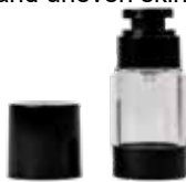
Black 30ml Airless Pump Label Size: 50mm(H) x 105mm(L)

Containing 1% encapsulated Retinol, Niacinamide, Hyaluronic Acid, Peptides & other hydrating & healing ingredients, this super serum will assist with reducing fine lines, wrinkles and uneven skin tone whilst maintaining a softer, firmer and clearer appearance.