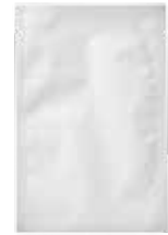
White Sheet Mask Sachet Label Size: 50mm(H) x 100mm(L) 2 Labels - Front & Back