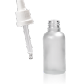
White 30ml Glass Bottle Dropper Label Size: 44mm(H) x 105mm(L)