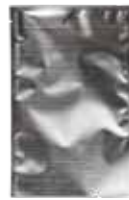
Silver Sheet Mask Sachet Label Size: 50mm(H) x 100mm(L) 2 Labels - Front & Back