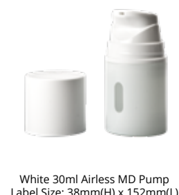
White 30ml Airless MD Pump Label Size: 38mm(H) x 152mm(L)