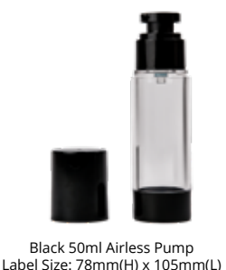
Black 50ml Airless Pump Label Size: 78mm(H) x 105mm(L)

5 – 50 units = $18.10 each 50 – 99 units = 15% discount 100 – 499 units = 20% discount 500 units+ = 35% discount