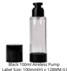
Black 100ml Airless Pump Label Size: 100mm(H) x 128MM (L)

5 – 50 units = $6.54 each 50 – 99 units = 15% discount 100 – 499 units = 20% discount 500 units+ = 35% discount