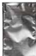
Silver Sheet Mask Sachet Label Size: 50mm(H) x 100mm(L) 2 Labels - Front & Back