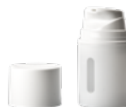
White 50ml Airless MD Pump Label Size: 50mm(H) x 152mm(L)