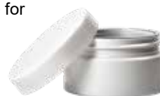
White 50g Jar Label Size: 17mm(H) x 190mm(L)