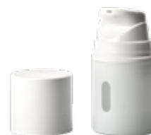
White 30ml Airless MD Pump Label Size: 38mm(H) x 152mm(L)