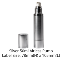
Silver 50ml Airless Pump Label Size: 78mm(H) x 105mm(L)