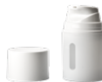
White 50ml Airless MD Pump Label Size: 50mm(H) x 152mm(L)