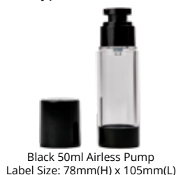
Black 50ml Airless Pump Label Size: 78mm(H) x 105mm(L)

A luxurious moisturiser with rich ingredients such as Vitamins A,C and E, Jojoba, Rosehip and Evening primrose oils, shea butter and marine collagens for hydration. Suitable for normal – dry/ageing skin types.