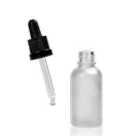
Black 30ml Glass Bottle Dropper Label Size: 44mm(H) x 105mm(L)

Our lightweight facial oil containing nutrient rich oils is designed to provide your skin with hydration, skin protection and moisture for an overall more radiant and glowing complexion.