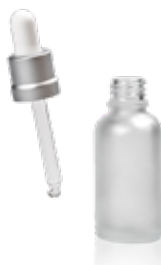
Silver 30ml Glass Bottle Dropper Label Size: 44mm(H) x 105mm(L)