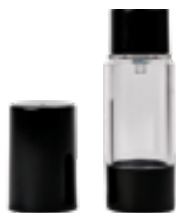
Black 30ml Airless Pump Label Size: 50mm(H) x 105mm(L)

This Vitamin C 20% treatment is a clinical strength, water free formulation that brightens, exfoliates, moisturises and aids in repairing the skin. Suitable for all skin types.