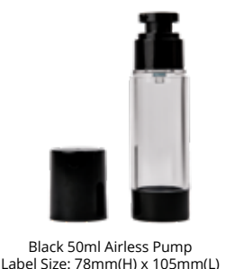
Black 50ml Airless Pump Label Size: 78mm(H) x 105mm(L)

5 – 50 units = $18.10 each 50 – 99 units = 15% discount 100 – 499 units = 20% discount 500 units+ = 35% discount