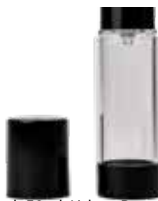
Black 50ml Airless Pump Label Size: 78mm(H) x 105mm(L)

5 – 50 units = $38.50 each 50 – 99 units = 15% discount 100 – 499 units = 20% discount 500 units+ = 35% discount