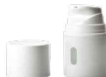
White 30ml Airless MD Pump Label Size: 38mm(H) x 152mm(L)