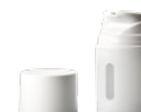
White 50ml Airless MD Pump Label Size: 50mm(H) x 152mm(L)