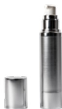
Silver 50ml Airless Pump Label Size: 78mm(H) x 105mm(L)