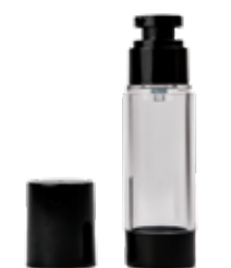
Black 50ml Airless Pump Label Size: 78mm(H) x 105mm(L)

A moisturiser containing Vitamin A, C & E & Hyaluronic acid. Great for maintaining moisture and fighting lines & wrinkles. Suitable for all skin types.