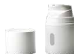
White 30ml Airless MD Pump Label Size: 38mm(H) x 152mm(L)