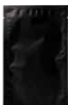
Black Sheet Mask Sachet Label Size: 50mm(H) x 100mm(L) 2, Labels - Front & Back

5 – 50 units = $5.45 each 50 – 99 units = 15% discount 100 – 499 units = 20% discount 500 units+ = 35% discount