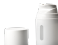
White 50ml Airless MD Pump Label Size: 50mm(H) x 152mm(L)