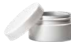
White 50g Jar Label Size: 17mm(H) x 190mm(L)