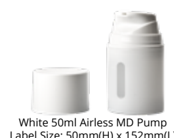
White 50ml Airless MD Pump Label Size: 50mm(H) x 152mm(L)