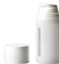
White 100ml Airless MD Pump Label Size: 80mm (H) x 152mm (L)