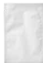
White Sheet Mask Sachet Label Size: 50mm(H) x 100mm(L) 2 Labels - Front & Back