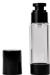
Black 50ml Airless Pump Label Size: 78mm(H) x 105mm(L)

Apply daily to entire face, avoiding the eye area. Allow to completely absorb before applying makeup. Can be used day and/or night. Apply generously to face after facial scrubs/masks, sunburn and shaving for a soothing treatment.