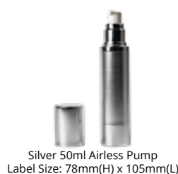
Silver 50ml Airless Pump Label Size: 78mm(H) x 105mm(L)