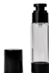
Black 50ml Airless Pump Label Size: 78mm(H) x 105mm(L)

Our Hand Cream has been formulated using Australian Essential Oils and Extracts. This thick cream will gently moisturise and protect your hands while nourishing them with nutrient rich extracts and oils. Suitable for all skin types.