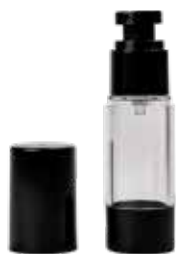
Black 30ml Airless Pump Label Size: 50mm(H) x 105mm(L)

5 – 50 units = $17.05 each 50 – 99 units = 15% discount 100 – 499 units = 20% discount 500 units+ = 35% discount