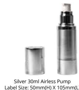
Silver 30ml Airless Pump Label Size: 50mm(H) X 105mm(L)