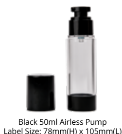
Black 50ml Airless Pump Label Size: 78mm(H) x 105mm(L)

5 – 50 units = $18.10 each 50 – 99 units = 15% discount 100 – 499 units = 20% discount 500 units+ = 35% discount