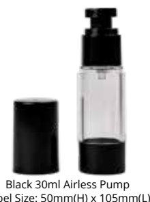
Black 30ml Airless Pump Label Size: 50mm(H) x 105mm(L)

5 – 50 units = $13.30 each 50 – 99 units = 15% discount 100 – 499 units = 20% discount 500 units+ = 35% discount