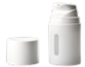
White 50ml Airless MD Pump Label Size: 50mm(H) x 152mm(L)

5 – 50 units = $75.00 each 50 – 99 units = 15% discount 100 – 499 units = 20% discount 500 units+ = 35% discount