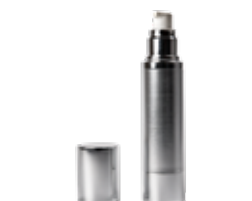
Silver 50ml Airless Pump Label Size: 78mm(H) x 105mm(L)