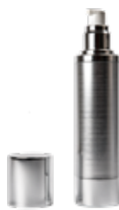
Silver 100ml Airless Pump Label Size: 100mm (H) x 128mm (L)