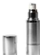
Silver 30ml Airless Pump Label Size: 50mm(H) X 105mm(L)