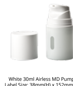
White 30ml Airless MD Pump Label Size: 38mm(H) x 152mm(L)