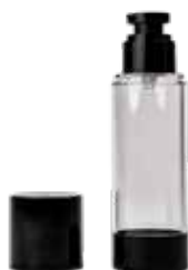
Black 100ml Airless Pump Label Size: 100mm(H) x 128MM (L)

A gel cleanser containing essential oils, fruit extracts & topical vitamins helps to maintain moisture in the skin, whilst soothing and clearing bacteria responsible for acne and impurities. Suitable for normal –oily skin types.