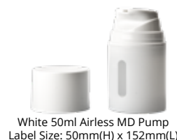
White 50ml Airless MD Pump Label Size: 50mm(H) x 152mm(L)