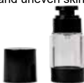
Black 30ml Airless Pump Label Size: 50mm(H) x 105mm(L)

Containing 1% encapsulated Retinol, Niacinamide, Hyaluronic Acid, Peptides & other hydrating & healing ingredients, this super serum will assist with reducing fine lines, wrinkles and uneven skin tone whilst maintaining a softer, firmer and clearer appearance.