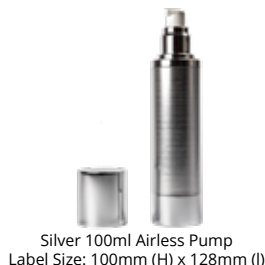
Silver 100ml Airless Pump Label Size: 100mm (H) x 128mm (L)