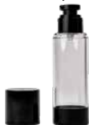
Black 100ml Airless Pump Label Size: 100mm(H) x 128MM (L)

This luxurious cream cleanser containing Australian essential oils & fruit acids will moisturise, nourish and hydrate the skin and assist in minimizing fine lines and wrinkles. Suitable for normal- dry skin types