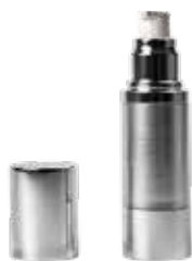
Silver 30ml Airless Pump Label Size: 50mm(H) X 105mm(L)