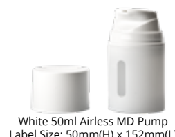
White 50ml Airless MD Pump Label Size: 50mm(H) x 152mm(L)