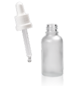
White 30ml Glass Bottle Dropper Label Size: 44mm(H) x 105mm(L)