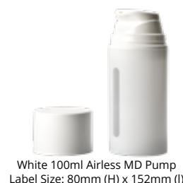
White 100ml Airless MD Pump Label Size: 80mm (H) x 152mm (L)