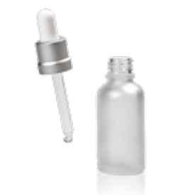
Silver 30ml Glass Bottle Dropper Label Size: 44mm(H) x 105mm(L)