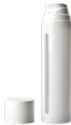
White 200ml Airless Pump Label Size: 80mm(H) x 152mm(L)

Our professional range is made for professional use only and not recommended for retail sale. The professional range is only available in white packaging, and comes with ACPHARM branding and basic instructions. If purchased in 5 or more units, we will apply your logo and contact details to the label – no name or description variations unless you are supplying your own label.