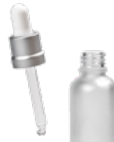
Silver 30ml Glass Bottle Dropper Label Size: 44mm(H) x 105mm(L)