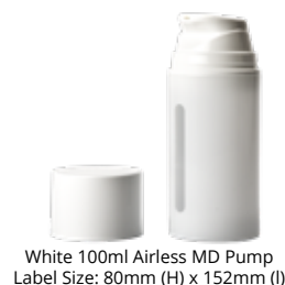
White 100ml Airless MD Pump Label Size: 80mm (H) x 152mm (l)