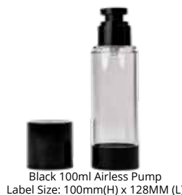
Black 100ml Airless Pump Label Size: 100mm(H) x 128MM (L)

5 - 50 units = $16.95 each 50 - 99 units = 15% discount 100 - 499 units = 20% discount 500 units+ = 35% discount