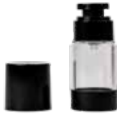
Black 30ml Airless Pump Label Size: 50mm(H) x 105mm(L)

Containing 1% encapsulated Retinol, Niacinamide, Hyaluronic Acid, Peptides & other hydrating & healing ingredients, this super serum will assist with reducing fine lines, wrinkles and uneven skin tone whilst maintaining a softer, firmer and clearer appearance.