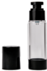
Black 50ml Airless Pump Label Size: 78mm(H) x 105mm(L)

This multitasking BB Cream provides SPF30 and a tinted finish to cover imperfections. It contains Peptides, Vitamin B3, Vitamin E, hyaluronic acid & lactic acid to hydrate and nourish the skin. Suitable for all skin types.