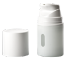
White 30ml Airless MD Pump Label Size: 38mm(H) x 152mm(L)