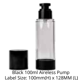
Black 100ml Airless Pump Label Size: 100mm(H) x 128MM (L)

5 - 50 units = $16.75 each 50 - 99 units = 15% discount 100 - 499 units = 20% discount 500 units+ = 35% discount