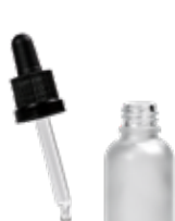
Black 30ml Glass Bottle Dropper Label Size: 44mm(H) x 105mm(L)

Combining the power of Vitamin B and other hydrating and healing ingredients, this super serum will assist in achieving a clearer, brighter and more even complexion.