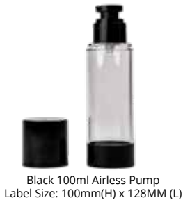
Black 100ml Airless Pump Label Size: 100mm(H) x 128MM (L)

5 - 50 units = $13.79 each 50 - 99 units = 15% discount 100 - 499 units = 20% discount 500 units+ = 35% discount