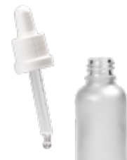
White 30ml Glass Bottle Dropper Label Size: 44mm(H) x 105mm(L)