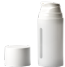
White 100ml Airless MD Pump Label Size: 80mm (H) x 152mm (L)