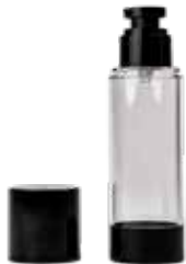
Black 100ml Airless Pump Label Size: 100mm(H) x 128MM (L)

5 - 50 units = $5.95 each 50 - 99 units = 15% discount 100 - 499 units = 20% discount 500 units+ = 35% discount