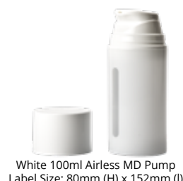
White 100ml Airless MD Pump Label Size: 80mm (H) x 152mm (l)