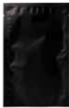
Black Sheet Mask Sachel Label Size: 50mm(H) x 100mm(L) 2, Labels - Front & Back

5 - 50 units = $4.95 each 50 - 99 units = 15% discount 100 - 499 units = 20% discount 500 units+ = 35% discount