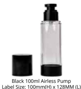
Black 100ml Airless Pump Label Size: 100mm(H) x 128MM (L)

5 - 50 units = $16.75 each 50 - 99 units = 15% discount 100 - 499 units = 20% discount 500 units+ = 35% discount