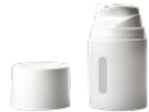
White 50ml Airless MD Pump Label Size: 50mm(H) x 152mm(L)