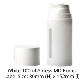
White 100ml Airless MD Pump Label Size: 80mm (H) x 152mm (l)